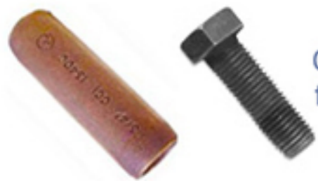
Couplings and Drive Studs for Ground Bar Installation