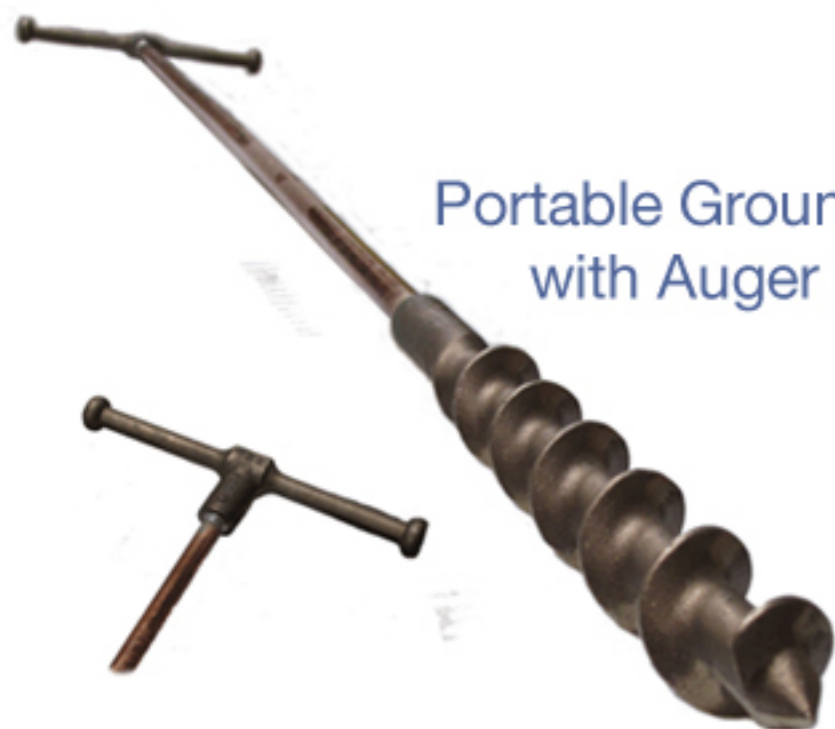
Portable Ground Rod with Auger Drill-End