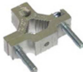
Grounding Clamps to Connect Grounding Wire to Antennas