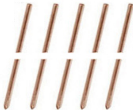
Copper Bonded Ground Rods in 8' and 10' lengths