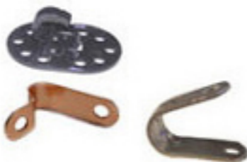
Wire Mounting Clips and Fasteners