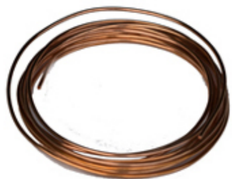
#4, #6 or #8 Solid Copper Grounding Wire