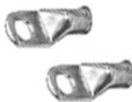
Wire Lugs for Ground Bar Assembly