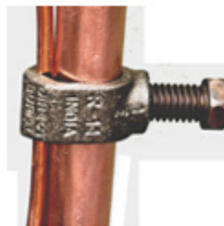
Acorn Clamps to Connect Grounding Wire to Ground Rods